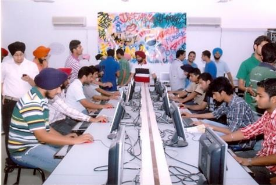
MASTIV Net Gaming Event